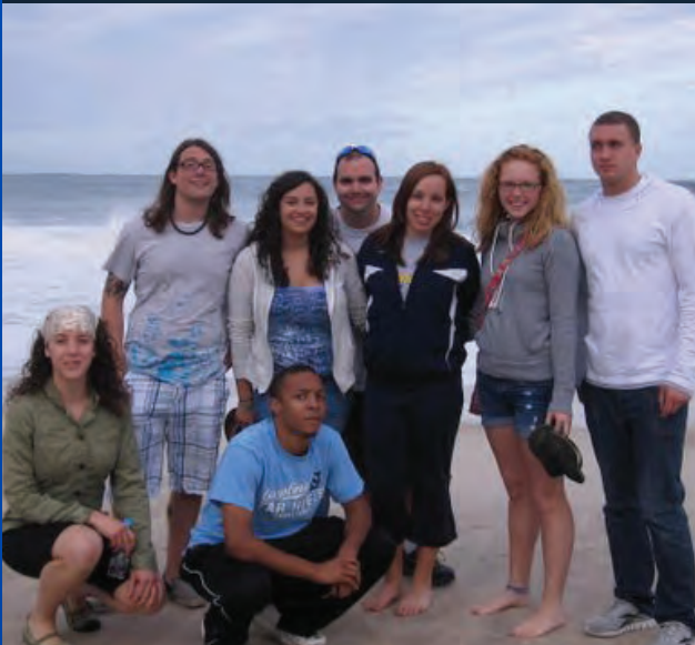
The first Brazil study abroad program allowed students to learn about how sport opportunities are provided for youth across a variety of socioeconomic levels, and observed leisure and activity habits that are culturally unique from America.