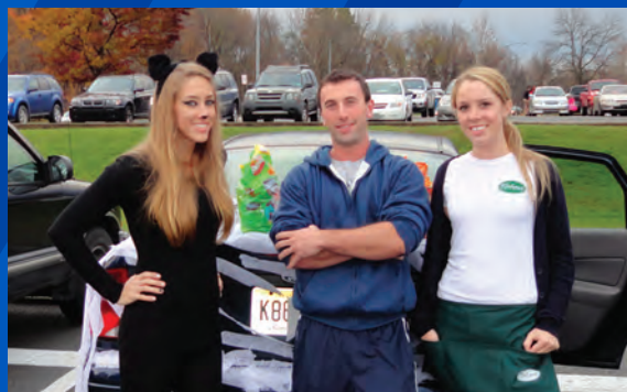
PETE Majors Club members participated in the 2011 WVU Trunk or Treat event. Students handed out candy to hundreds of local children. Other club activities included support for the Fall Special Olympics in Parkersburg, W. Va. PETE students attended the WVAHPERD Conference this fall.