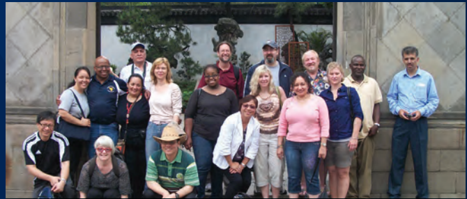
pg. 11 Global conference on physical education and sports.

Perspective is printed twice each year, in winter and summer, for the alumni, friends, and other supporters of the WVU College of Physical Activity and Sport Sciences.