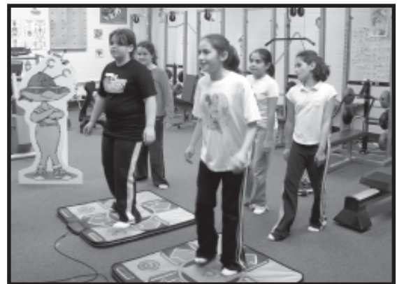
Children in the WV Motor Development Center's Choosy Kids Club experiencing Dance-Dance Revolution