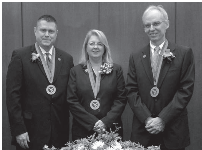
2009 Hall of Fame Inductees